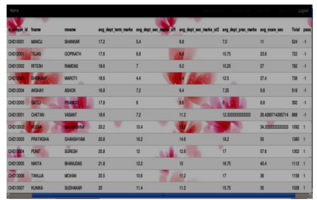
Fig.3. Pre-processed dataset

The Result i.e. the universities applicable for the individual students is shown in the Fig.4. Also the chance of getting admission into each university is shown by the percentage; by keeping 50% as the margin. It can be read as for example student Nikita, 61.7% chance is to get admission into Pune University