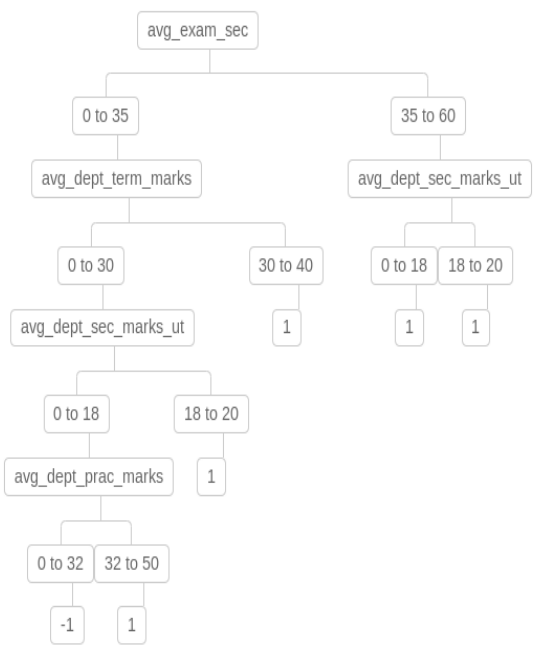
Fig.2. Decision tree for Mumbai University

Initially the raw dataset is available with attributes Student id. Name. Theory mrks, Practical mrks. Term mrks, Unit mrks in a single .csv file. Though whole dataset is obtained in a single .csv file; it was segregated into different files for each attribute. These separate files are uploaded into the system for pre-processing which calculates the averages for each section for individual students. In further process, algorithm is implemented.